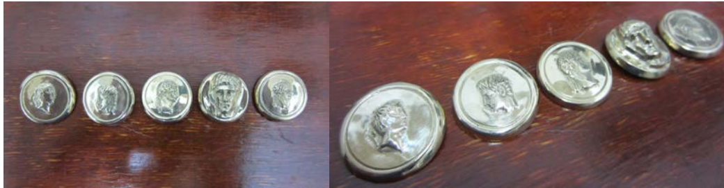
My creative waxwork on the subject.

These small studs are similar to Roman Phalerae, but in small-scale. From the limited archeology findings similar images are observed in both cases, Imperial Images together in combination with Victory and difference is in the size. So, I think that it is quite possible that some of these imperial images are given to the military flags on different occasions.