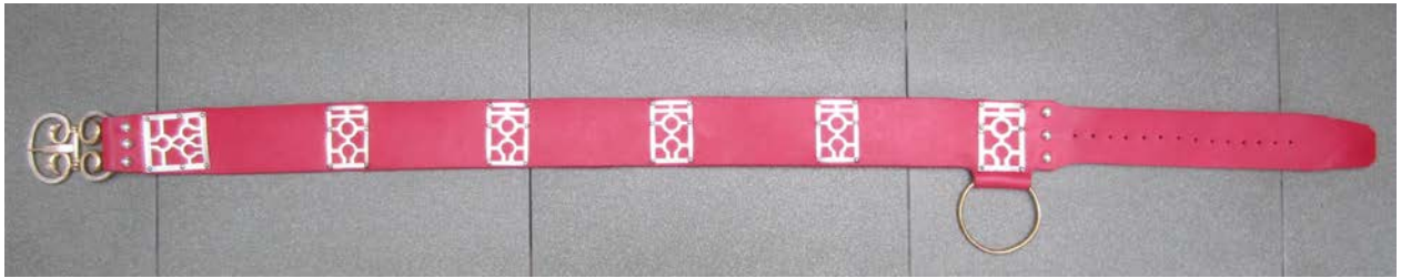
Backside and method of attachment.