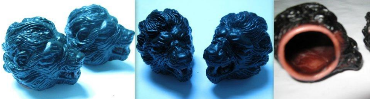
Making the new lion head on a black wax.By a private order.