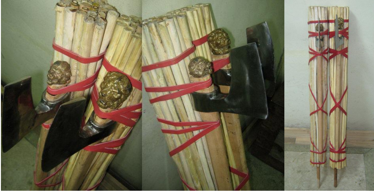
Sticks that we use are cut from the forest.