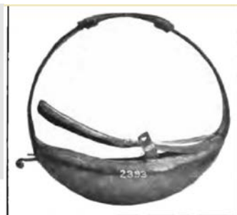
Bronze Purse which was found with three gold and sixty silver coins in it at the bottom of an old Roman quarry. [From the hill of Barcombe, near Borcovicus] [No. 1703]