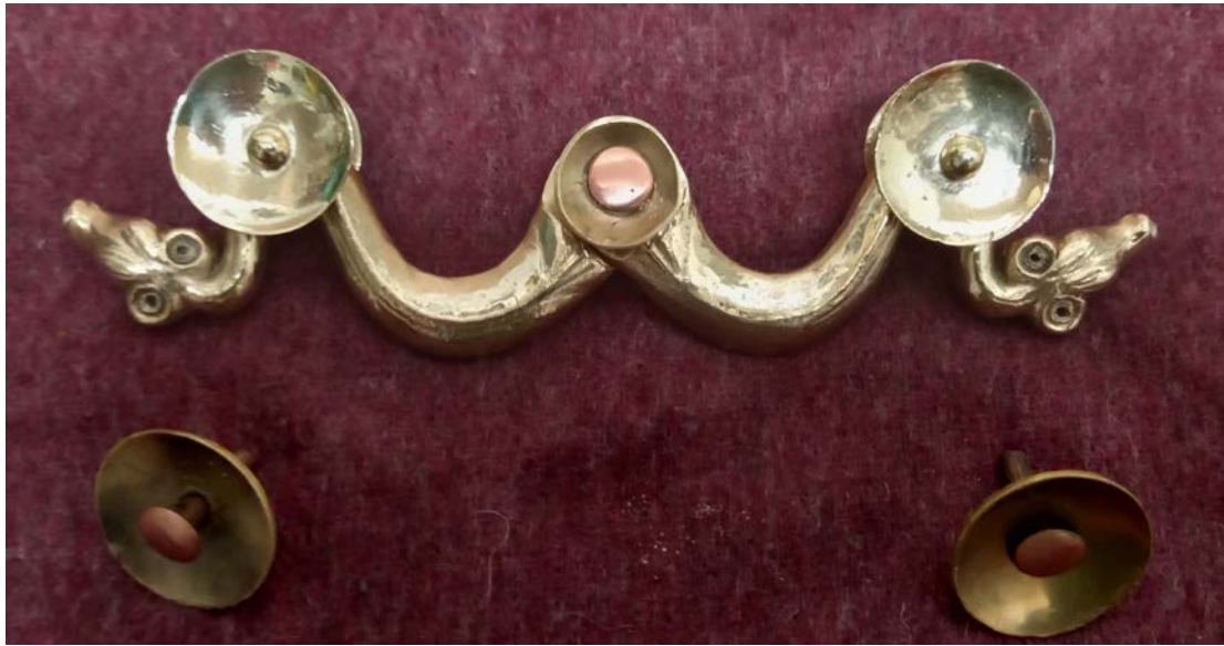
My wax project.